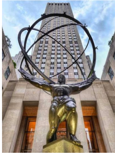
Rockefeller Center, New York