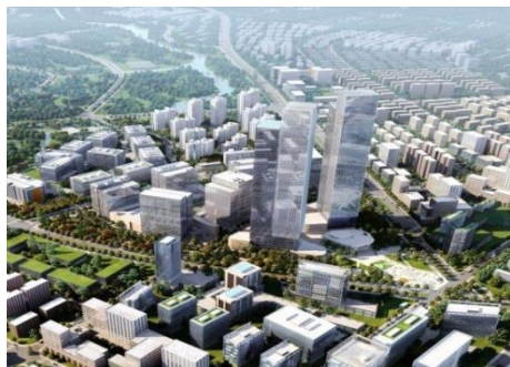
The Springs, Shanghai