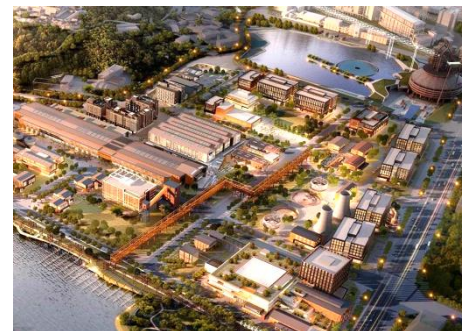
Capital Steel, Beijing