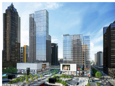
The Summit, Suzhou