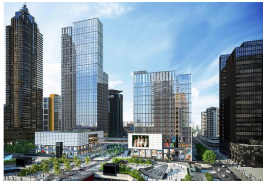
The Summit, Suzhou