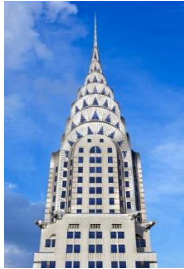
Chrysler Building, New York