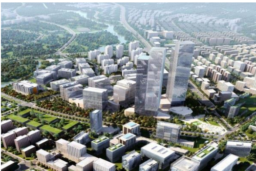
The Springs, Jiangwan (Shanghai)